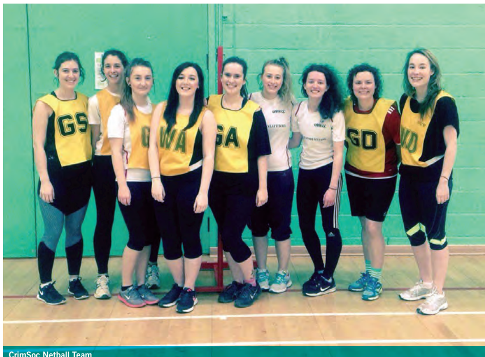
CrimSoc Netball Team